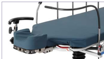
Flexible tube doubles as air delivery and drape support.