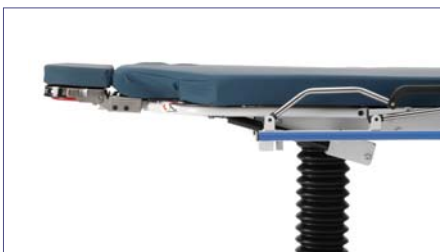
Enhanced-clearance, dual-articulating headpiece maximizes surgical access.

Stryker's eye surgery stretcher offers the greatest head-end clearance in the industry, giving surgeons ample leg room to maneuver while performing delicate eye procedures. The firmly-locking work surface and mobile design combine to increase patient security and surgical throughput.